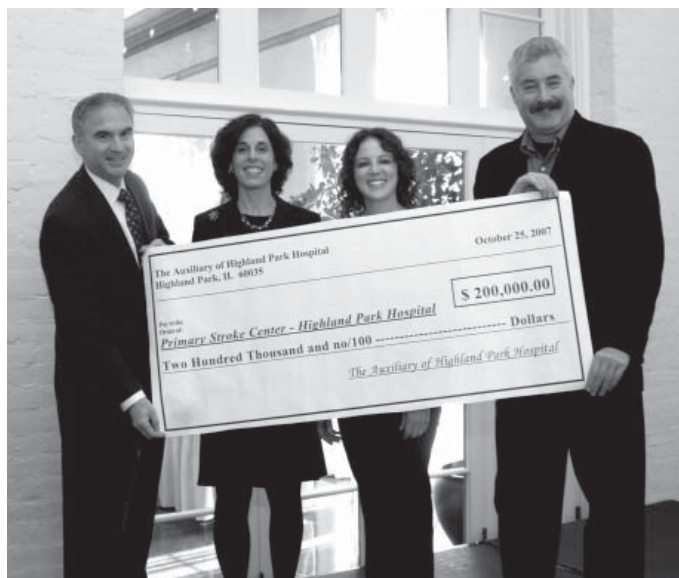
Caption to come.