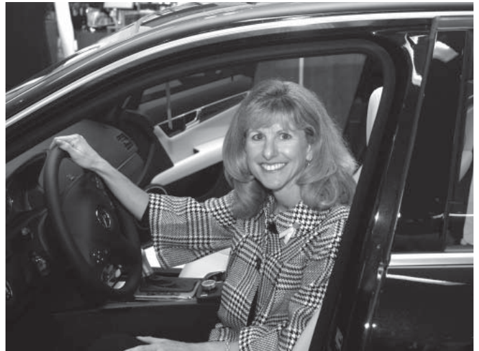
Caption to come.