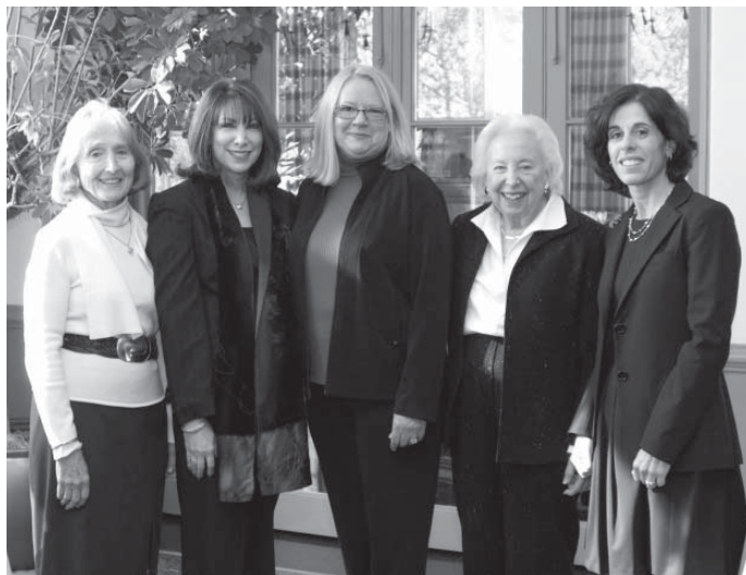
Caption to come.

In June, you will receive our request for donations to the Primary Stroke Center. Please join together with the Auxiliary Board in this common goal of supporting excellence in healthcare at Highland Park Hospital. Remember, when seconds count, your response can make a difference.