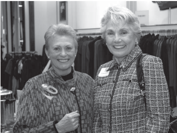
Caption to come.