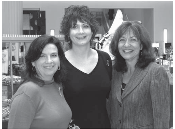
Caption to come.