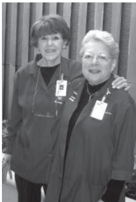
Captions to come.