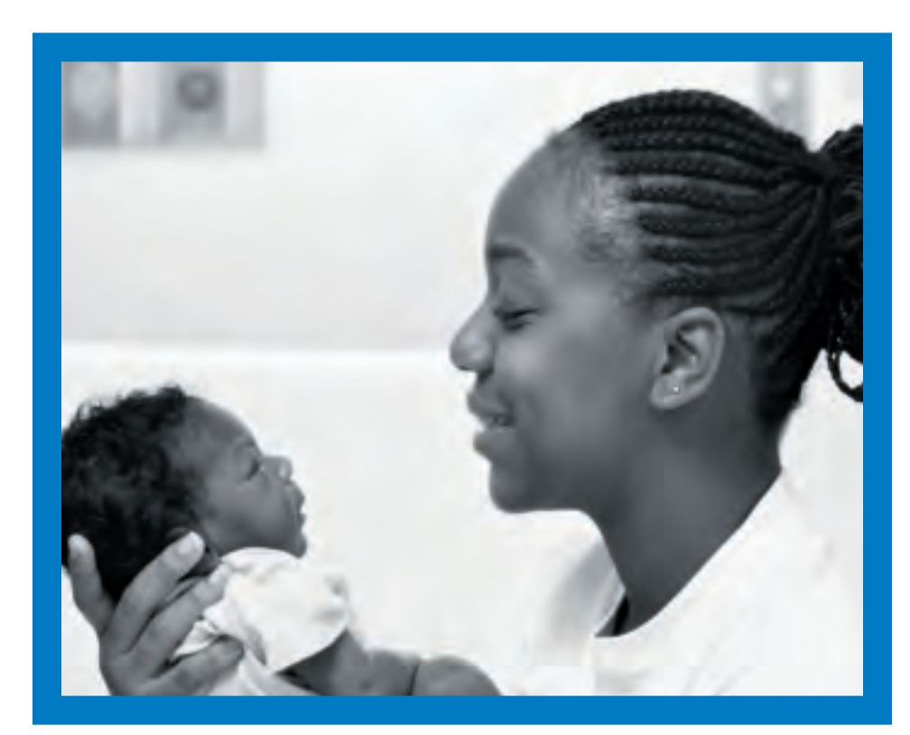
Highland Park Hospital served as one of the main pilot sites for questionnaires to patients in Lake County for Phase 2 of the Community Action for Child Health Equity (CACHE), which is studying the causes of preterm birth.

The Hospital is responsible for conveying information about the threat, treatment and containment plans, the impact of the emergency and other vital data to the government, the media and, most important, the community and its residents.