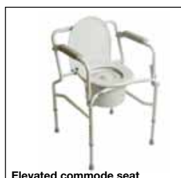
Elevated commode seat