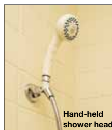
Hand-held shower head