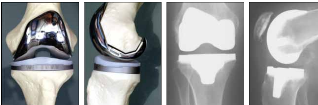
The standard total knee in a plastic model is shown on the left, and X-rays of the knee following surgery are shown on the right.

During knee replacement surgery, a metal prosthesis that resembles the normal shape of the femur in the knee joint is placed over the end of the bone. The top of the tibia is replaced with a metal plate with a small stem that reaches down into the bone. The femoral component articulates with a specially shaped polyethylene tibial insert that attaches to the tibial plate. All of these components are inside the joint with preservation of the normal capsule and major stabilizing ligaments on the sides of the knees. Generally, the undersurface of the kneecap, or patella, also is resurfaced with a polyethylene implant. These components are fixed with cement or bone ingrowth into porous surfaces.