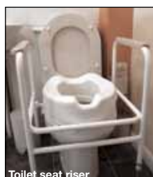
Toilet seat riser