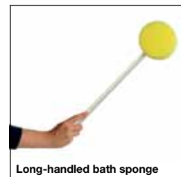
Long-handled bath sponge

Write down any questions you may have for your doctor or nurse: