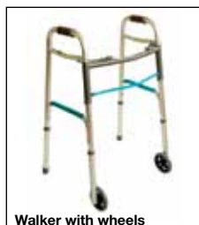
Walker with wheels