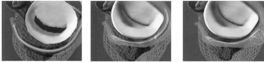
Figure 1. Annuloplasty via the coronary sinus (CS). In the left panel a guide catheter has been passed from the right atrium into the CS, to allow delivery of a device in the anterior interventricular vein or proximal CS. Note that the mitral leaflets do not coapt adequately. The middle panel shows a cardiac dimensions annuloplasty device partially deployed. On the right, the device has been deployed and tensioned, and the guide catheter has been removed. The mitral leaflets now coapt as a result of tension placed on the valve to compress the septal-to-lateral dimension.

degree of reduction in mitral regurgitation can thus be evaluated, after which the device can be removed and the planned surgical procedure completed. Preliminary work with two devices has shown improvements in mitral regurgitation, but not yet of a degree sufficient to consider using these devices for permanent implantation.