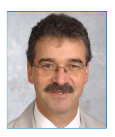
"The great thing about our EMR system is it's essentially a multi-specialty group without walls. You function as if everyone's together in the same building, getting real-time information, from test results to specialist visits – instantly."