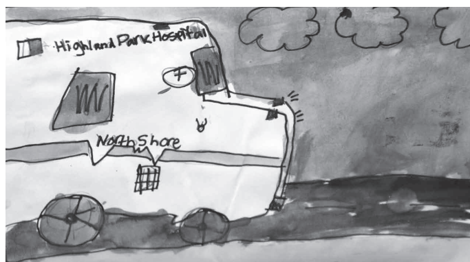
Art work from students at Highland Park Schools depicting Highland Park Hospital