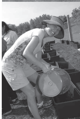
Volunteers participating in Dig Day planning and planting a community garden