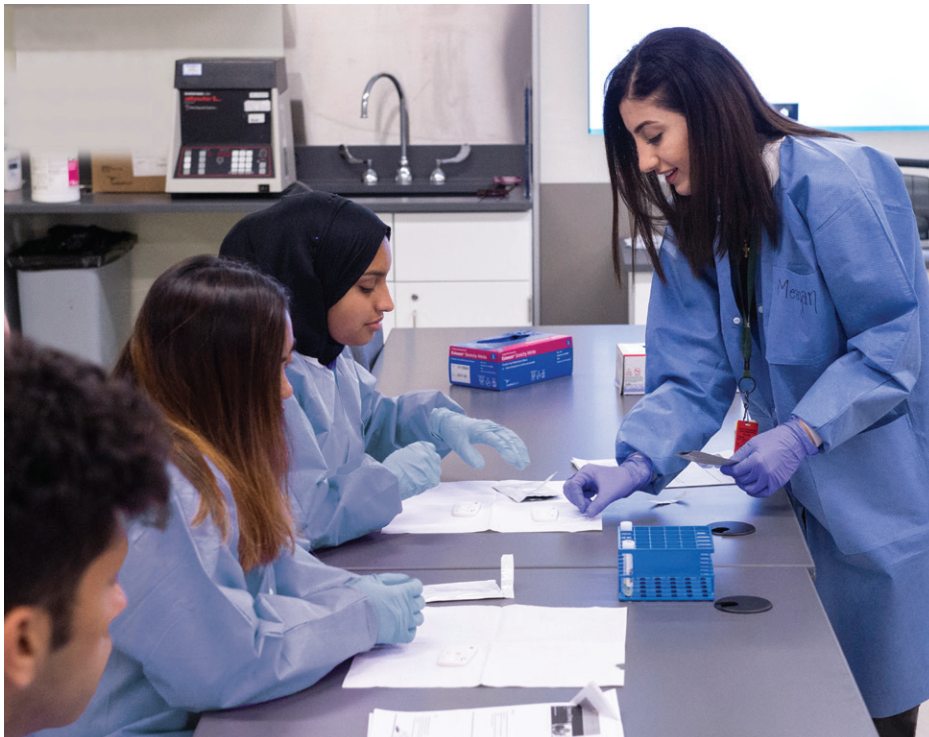
Students from Niles Township High School District 219's Education to Careers program learn about a variety of medical careers as NorthShore professionals lend their expertise to the volunteer partnership.

Busy NorthShore professionals volunteer their time to help students get an inside look at future career possibilities, allowing them to make more informed decisions about college and careers. Students learn the pros and cons of a wide range of careers from laboratory technicians to physicians and have the opportunity to ask questions and learn about their education backgrounds.