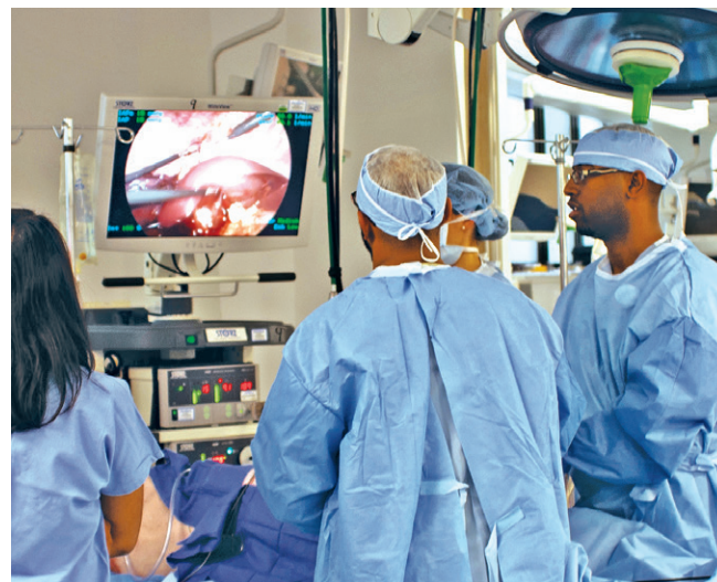
The Grainger Center for Simulation and Innovation provides an invaluable educational opportunity for students to learn and practice surgical procedures in a safe, controlled environment.