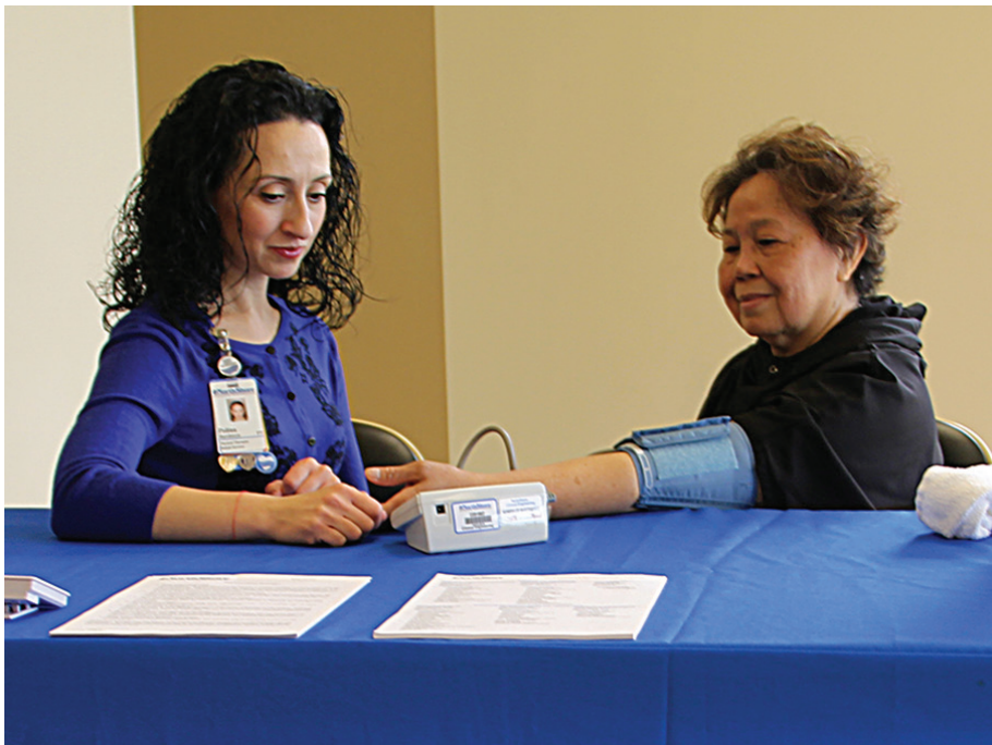
Free blood pressure screenings provided at regular community events are among the many ways NorthShore works to improve the health of the community.

The comprehensive program provides disease management, subspecialty care, an exercise training component and a community garden. Education and disease management are critical as diabetes can be a precursor to heart disease, stroke, blindness and kidney disease.